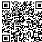
QR Code for giving via PayPal.

*YTD Shortage currently being covered by special gifts